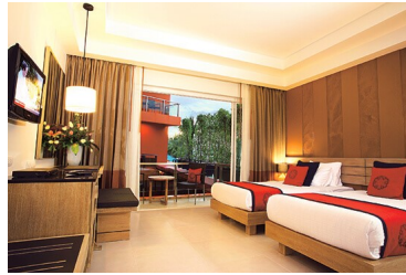
The Small Boutique